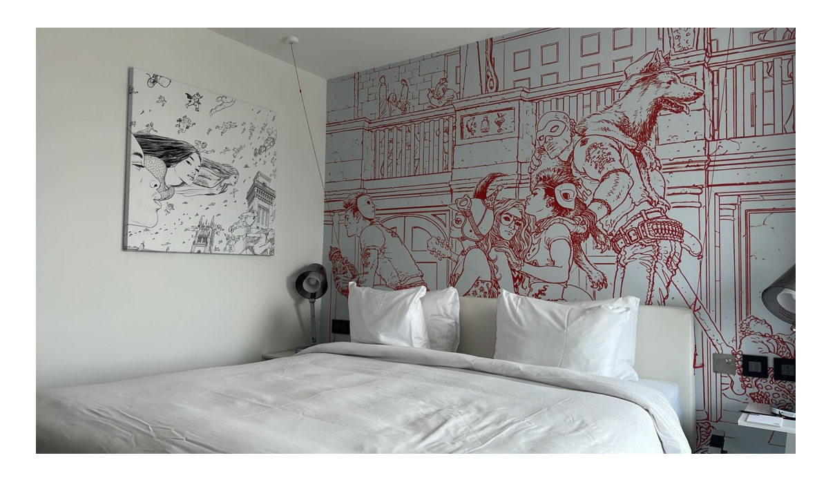
Frank Quitely's artwork in one of the accessible bedrooms in the Radisson Red Hotel