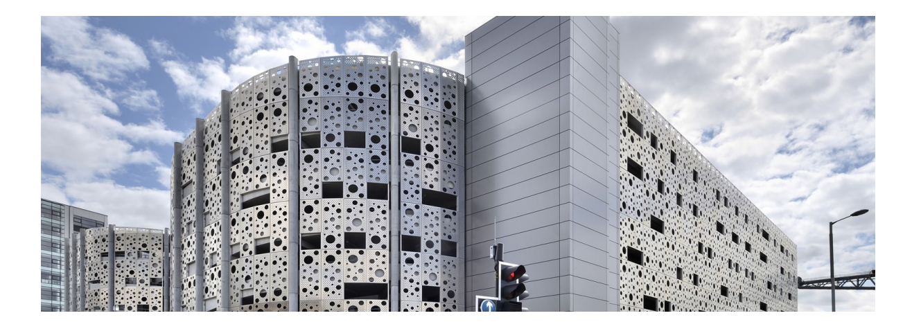
The Cheesegrater at the SEC, a masterpiece of culinary-carparking fusion.

What is the distance from the nearest door of your main hotel(s) to the closest entrance of the convention site? What are the transportation options for those who prefer not to walk or who have mobility difficulties?